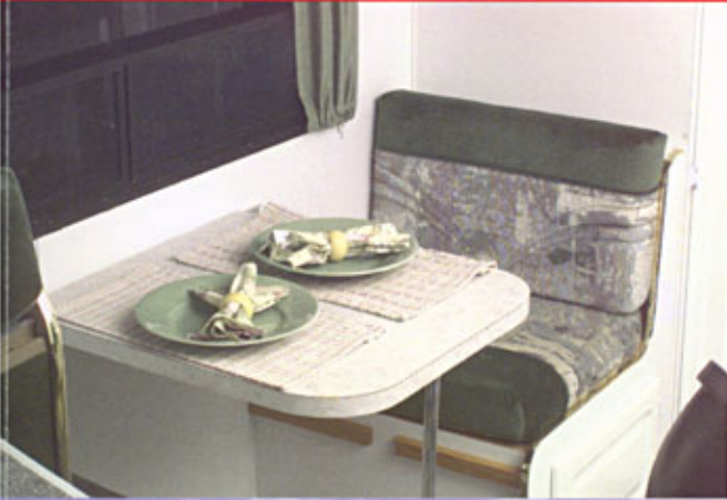
Dinette / Single Bed Option.