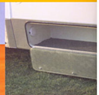
Very Generous Lighted Exte