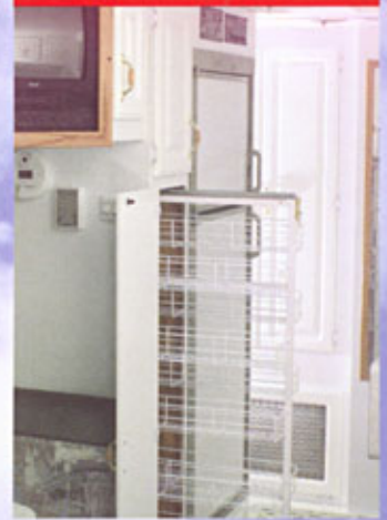
Large Closet w/ 15,000 btu Air Conditioner, Ducted from Ceiling