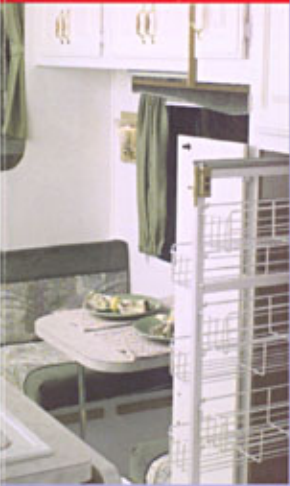
Single Dinette w/Slide-Out Pantry.