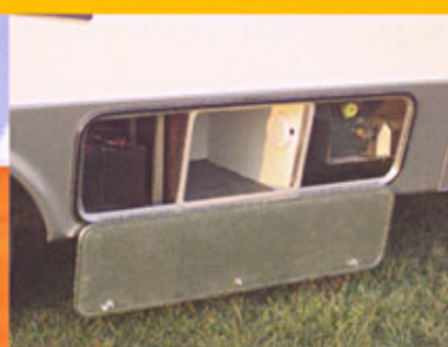
Dual Battery & LPG Access w/ Large Storage Compartment.