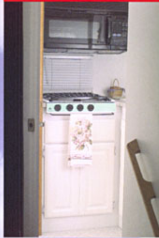
Microwave/Convection Oven & 3-burner Stove-Std. Equip.