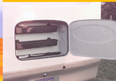
Rear Trunk Area w/ Removable Storage Trays.