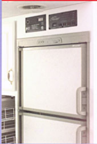
8 cu.ft. Refrigerator w/Auto. Fuel Selection Feature.