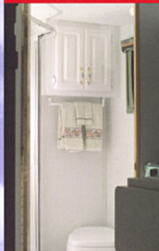
Spacious Bathroom w/Full Stand-Up Shower.