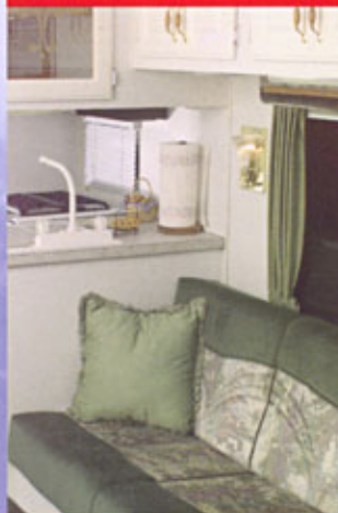
Ample Galley Area w/ Generous Overhead Storage.