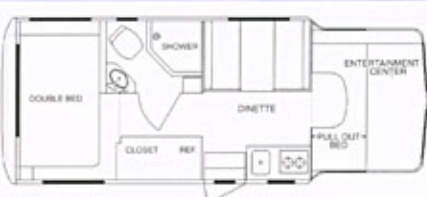
Double Bed/Double Dinette