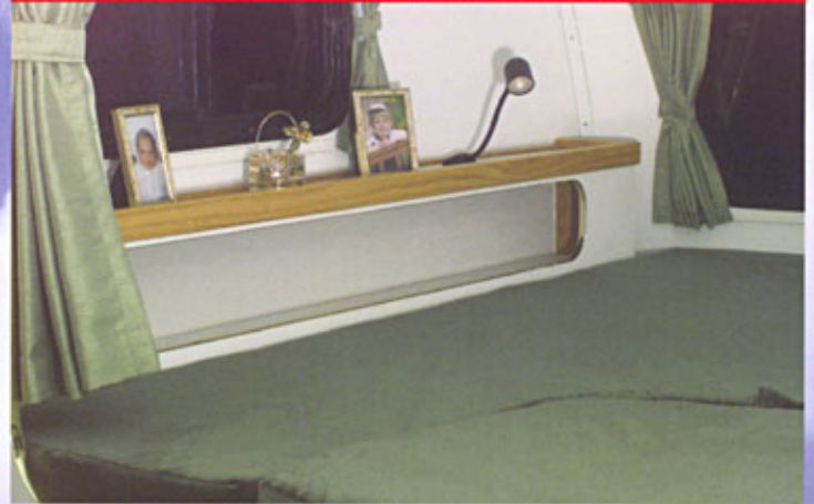
Full 60" Queen Bed w/ Head Board.